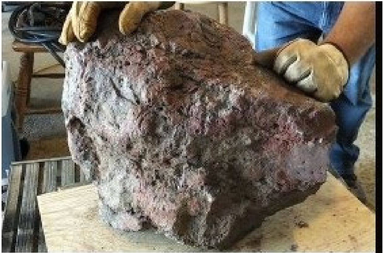
Figure 2: Photo of the Cousineau Boulder