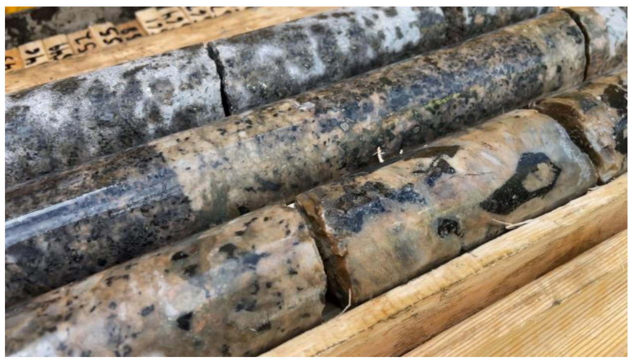
[Core samples from the Nagagami Carbonatite Complex]

At the Nagagami Niobium and Rare Earths Property, a total of 1,302 meters of drilling were completed, spread between two vertical holes. Drilling was exploring a magnetic low previously identified on the Nagagami Carbonatite Complex.