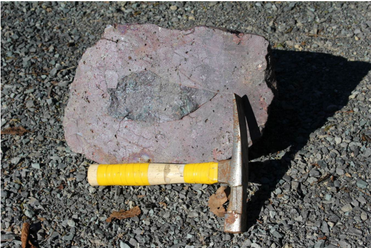
Figure 2: The Cousineau Boulder cut in half.

Work will continue during the 2022 field season including a helicopter airborne survey, glacial till investigations and diamond drilling.